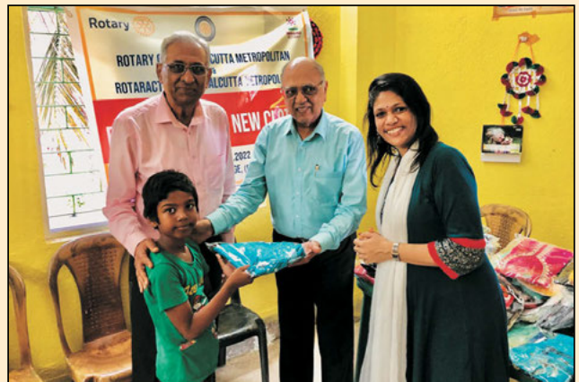
President distributing the new clothes