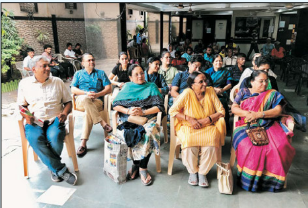
A view of audience