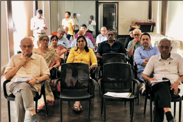
A view of members present