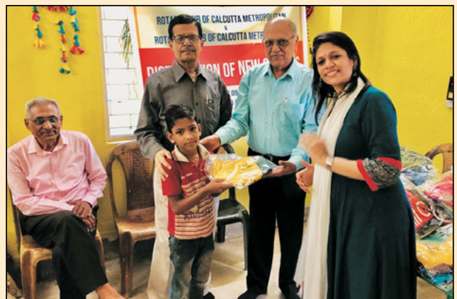
New Clothes being distributed