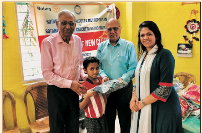
Distribution of New Clothes