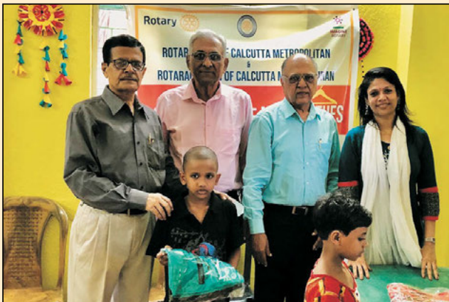
Group photo of RCCM members with beneficiary