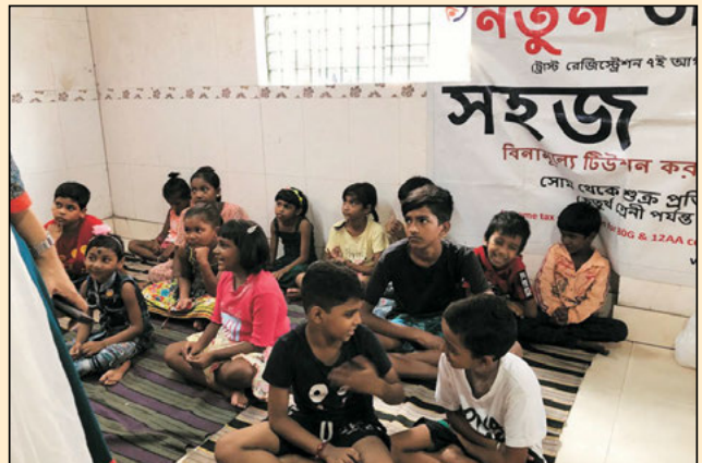
Inmates of Notun Jiban