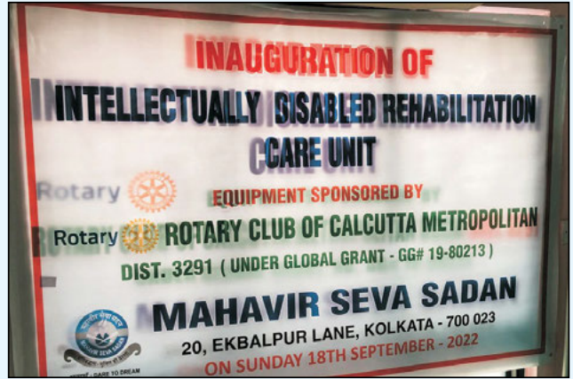
Banner for the GG project