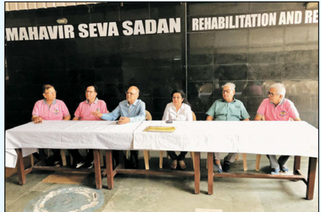
A view of Head table