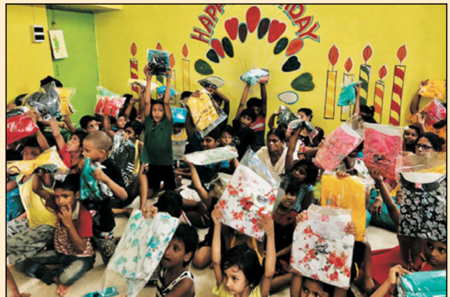
Children full of joy and happiness after getting new clothes