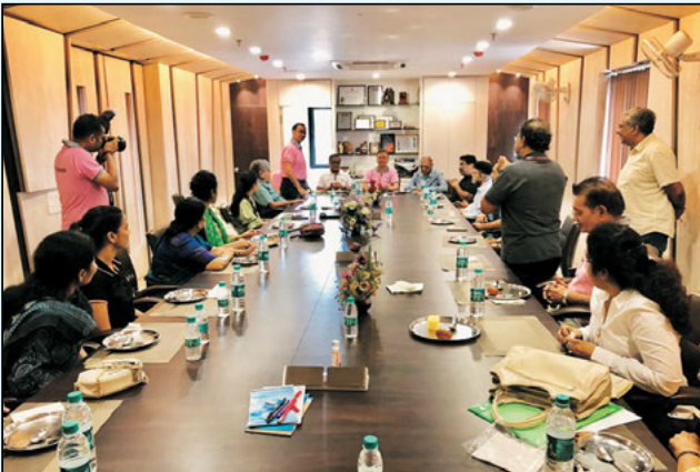
Formal introduction of members of MSS and RCCM