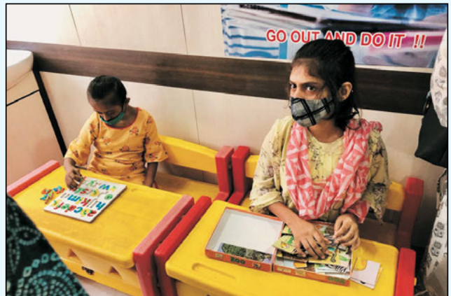
Another view of CP children