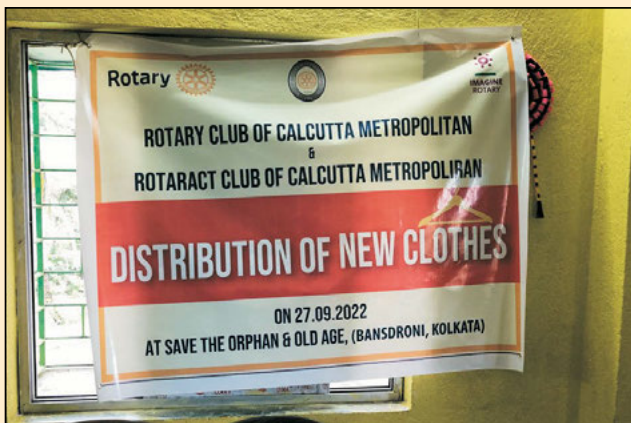
A view of Banner