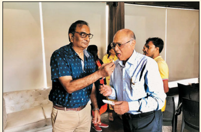
Birthday boys for the month of September-Cake cutting