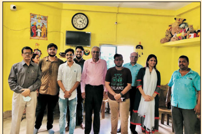
Group photo of RCCM members, Rotaractors and NGO