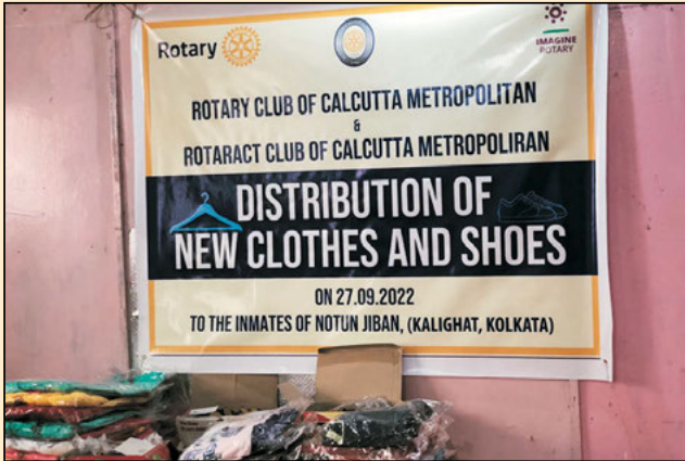
View of Banner