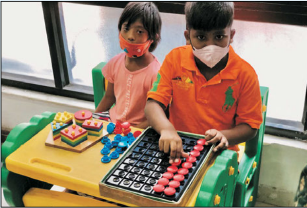
CP children enjoying the game