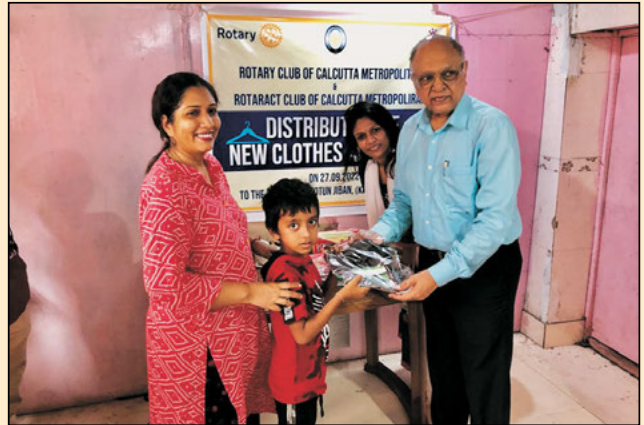
New Clothes is being distributed by the President