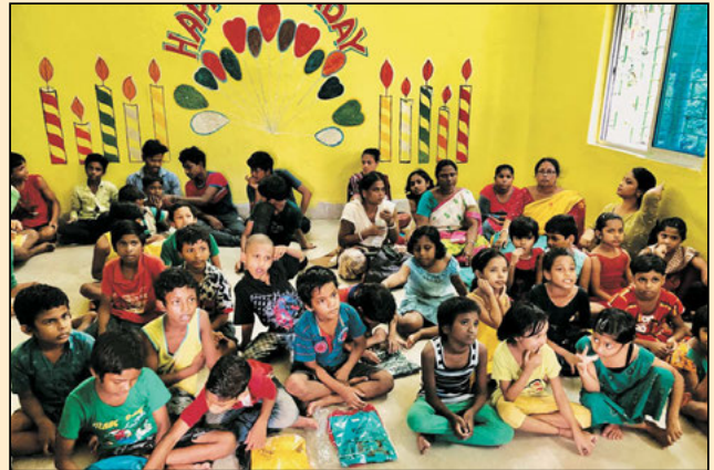
Children waiting for new clothes

Here our Rotaract Club of Calcutta Metropolitan played a very important role in locating this NGO, which is in dire needs of lot of facilities. Our RCCM team listened to their various problems and we hope we may be able to help them so that inmates staying there can have a more comfortable life and education.