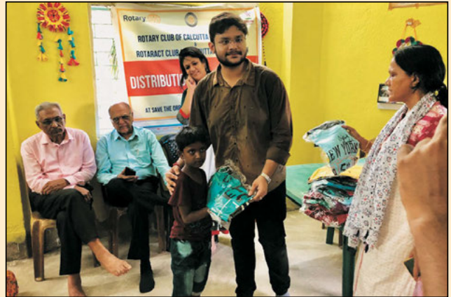
Rotaractor handing over new clothes