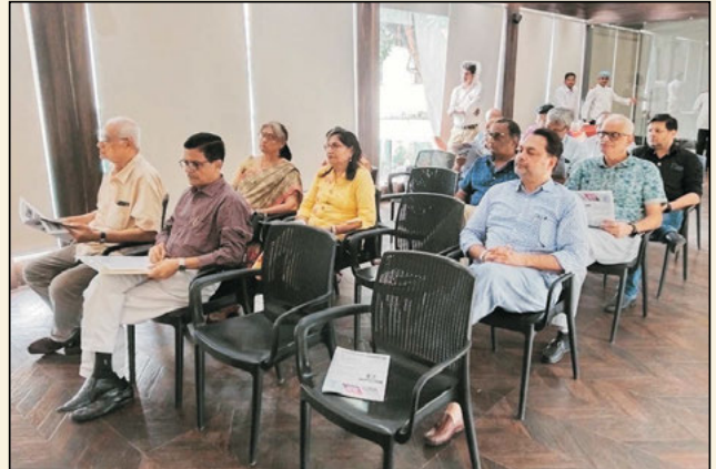
Another view of members present