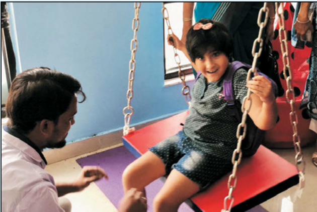
A Cerebral Palsy children being trained by the physician