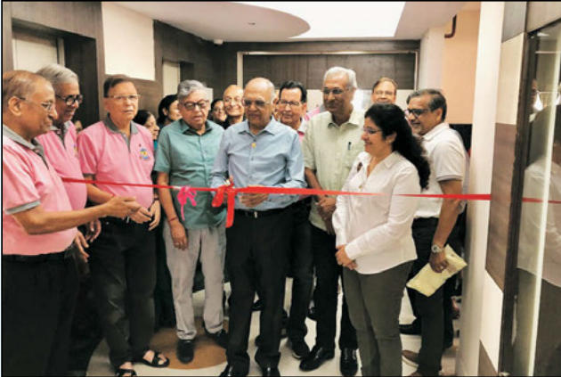
Inauguration of Rehabilitation of Cerebral Palsy Unit