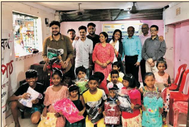
Group photo of RCCM Members, Rotaractors and beneficiaries