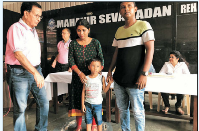
This CP child now able to speak frequently