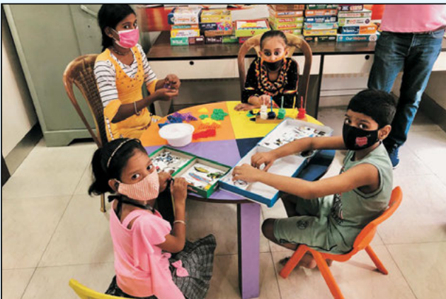
CP children playing with games