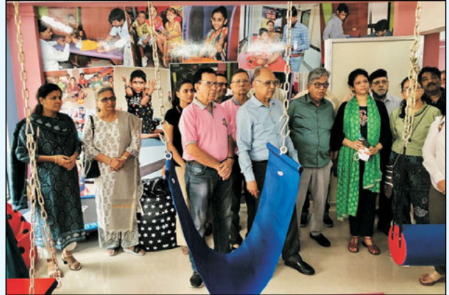
Members of RCCM and MSS reviewing the Unit